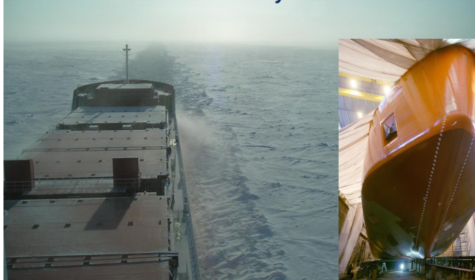
NORILSKIY NICKEL in Yenisey channel

The vessel left Aker Yards Helsinki shipyard for ice trials on March 3, 2006.