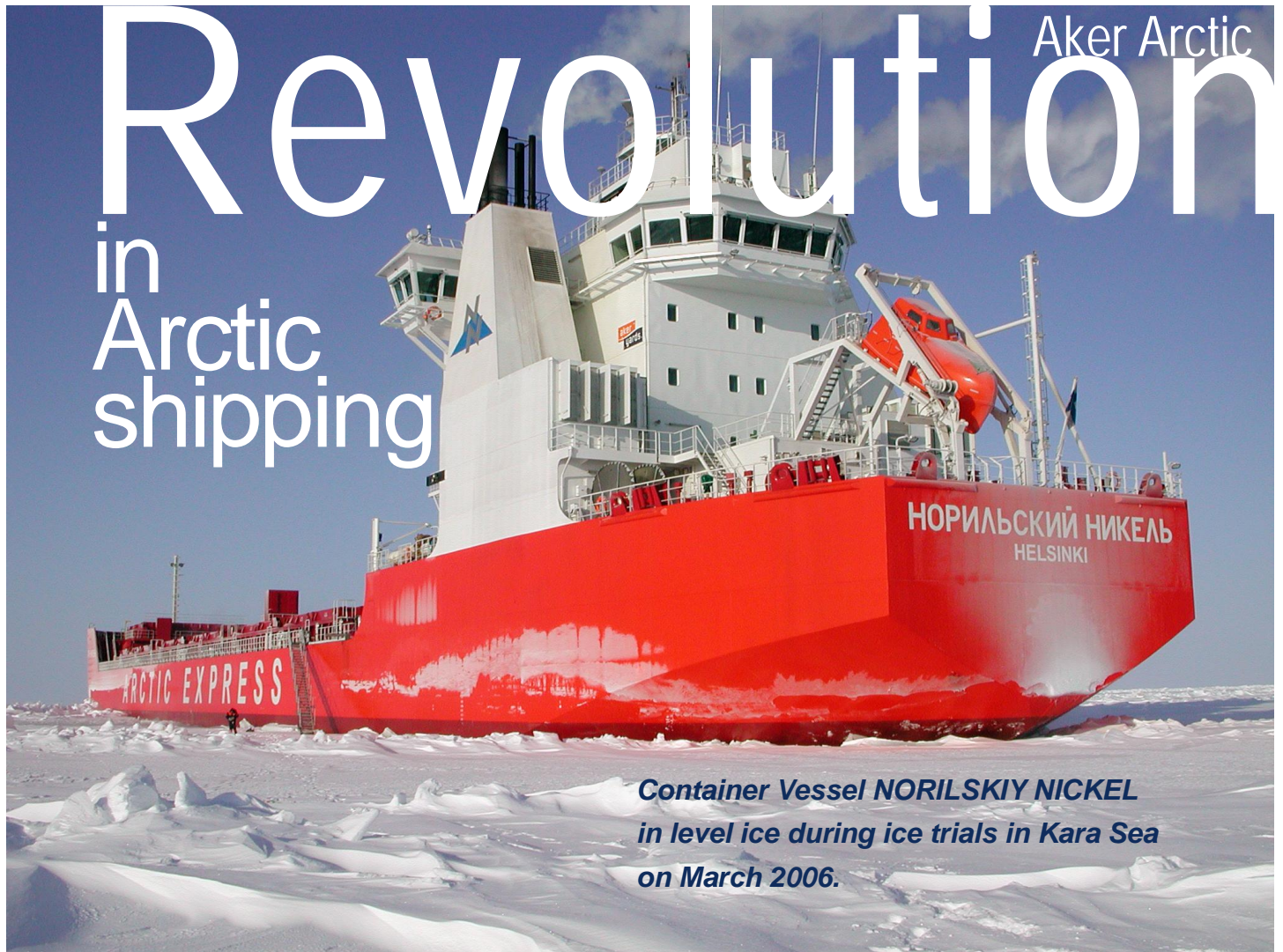
Container Vessel NORILSKIY NICKEL in level ice during ice trials in Kara Sea on March 2006.