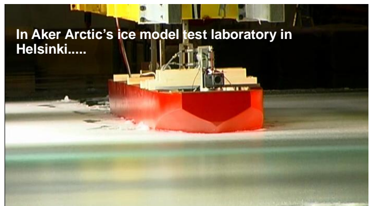
In Aker Arctic's ice model test laboratory in Helsinki.....

The new vessel is a prototype for a series of five which are to replace the current SA-15 type vessels that have been in successful use for the last twenty years. These vessels were built in Finland by Wärtsilä and Valmet shipyards in the 1980's. Aker Yards Helsinki yard built Norilskiy Nickel, and delivered her in early 2006.