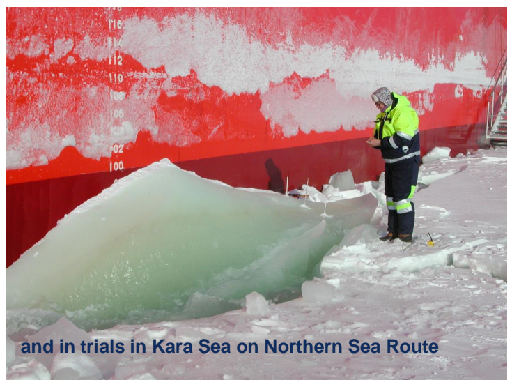
and in trials in Kara Sea on Northern Sea Route